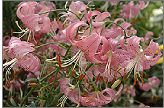
Pink Tiger Lily flowers