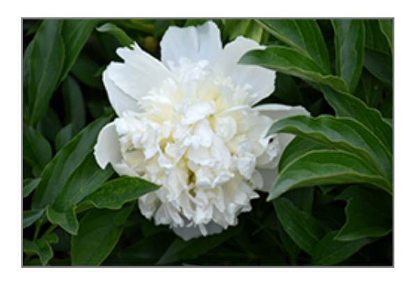
Lancaster Imp Peony flowers

This fine bomb-type peony is a captivating sight when the buds open to reveal elegant white blooms with golden yellow anthers; the fragrant flowers open on stiff stems making them an excellent cut flower; impressive when massed in groupings