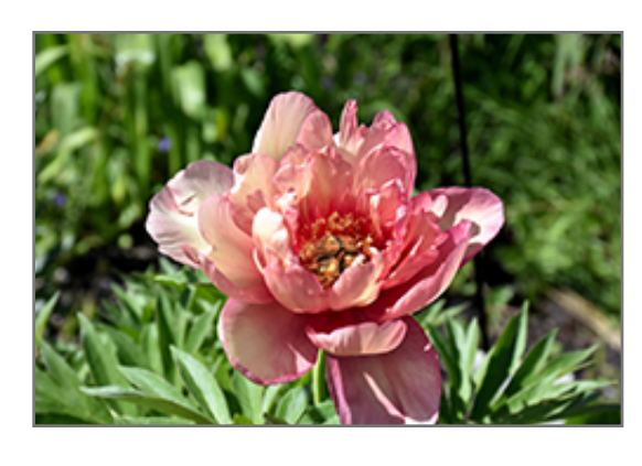
Enduring Rainbow Itoh Peony flowers

This captivating peony will create a dramatic late spring display in garden and border plantings; the buds open to reveal stunning peachy-rose blooms with touches of yellow and soft cream; strong study stems allow for flowers to be an eye-catching display