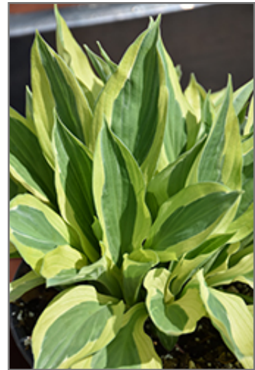
Yellow Polka Dot Bikini Hosta foliage