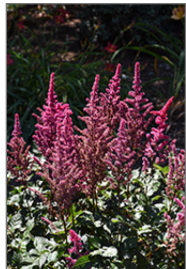
Visions Volcano Astilbe in bloom