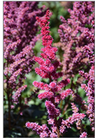
Visions Volcano Astilbe flowers