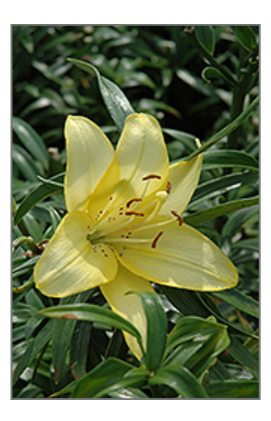
Royal Justice Lily flowers

Royal Justice Lily features bold yellow trumpet-shaped flowers at the ends of the stems in mid summer. The flowers are excellent for cutting. Its narrow leaves remain green in colour throughout the season.