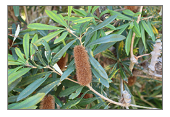
Coast Banksia flowers (faded)

Coast Banksia is recommended for the following landscape applications;