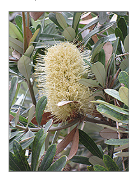
Coast Banksia flowers