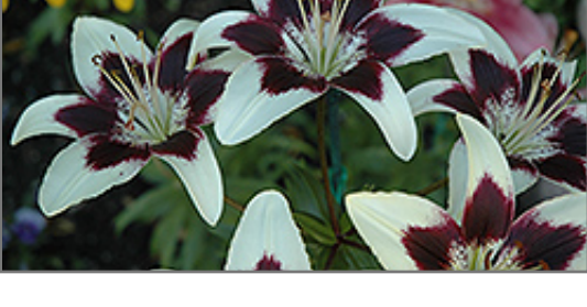
Purple Rain Lily flowers

Purple Rain Lily will grow to be about 20 inches tall at maturity, with a spread of 12 inches. When grown in masses or used as a bedding plant, individual plants should be spaced approximately 10 inches apart. It grows at a fast rate, and under ideal conditions can be expected to live for approximately 10 years. As an herbaceous perennial, this plant will usually die back to the crown each winter, and will regrow from the base each spring. Be careful not to disturb the crown in late winter when it may not be readily seen!