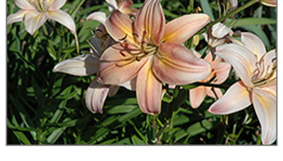
Miranda Lily flowers

Miranda Lily will grow to be about 24 inches tall at maturity, with a spread of 12 inches. When grown in masses or used as a bedding plant, individual plants should be spaced approximately 10 inches apart. It grows at a fast rate, and under ideal conditions can be expected to live for approximately 10 years. As an herbaceous perennial, this plant will usually die back to the crown each winter, and will regrow from the base each spring. Be careful not to disturb the crown in late winter when it may not be readily seen!