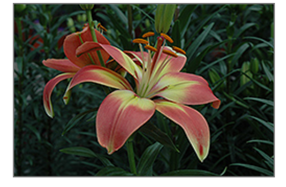
Jacqueline Lily flowers