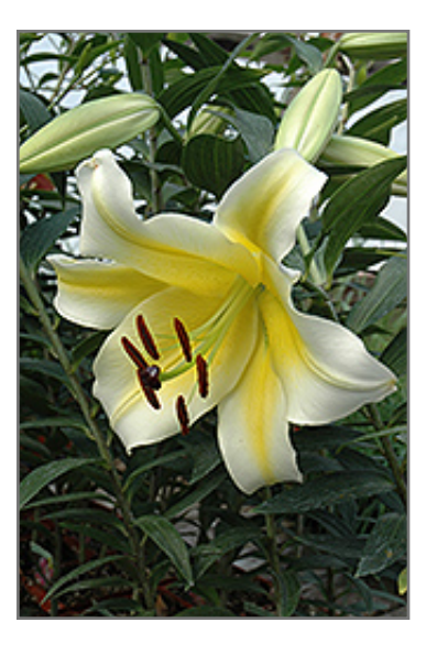
Conca D'Or Lily flowers

Conca D'Or Lily features bold lightly-scented nodding buttery yellow trumpet-shaped flowers with yellow throats at the ends of the stems in mid summer. The flowers are excellent for cutting. Its narrow leaves remain green in colour throughout the season.