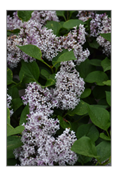
Little Darling Lilac flowers