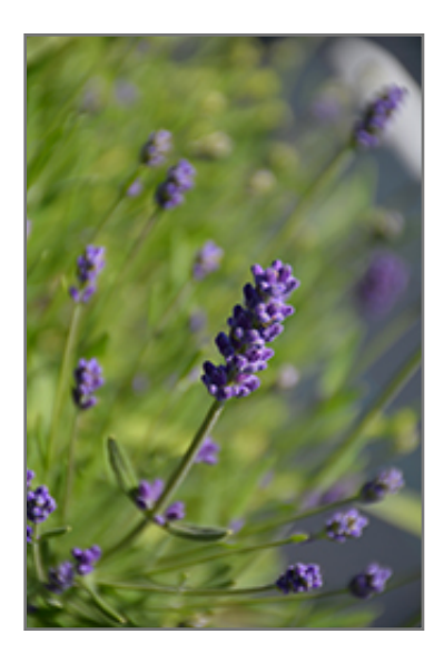
LaDiva Eternal Elegance Lavender flower buds

LaDiva Eternal Elegance Lavender is recommended for the following landscape applications;