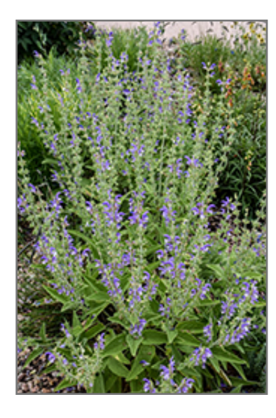
Olympus Gold Leaf Sage in bloom

Olympus Gold Leaf Sage is recommended for the following landscape applications;