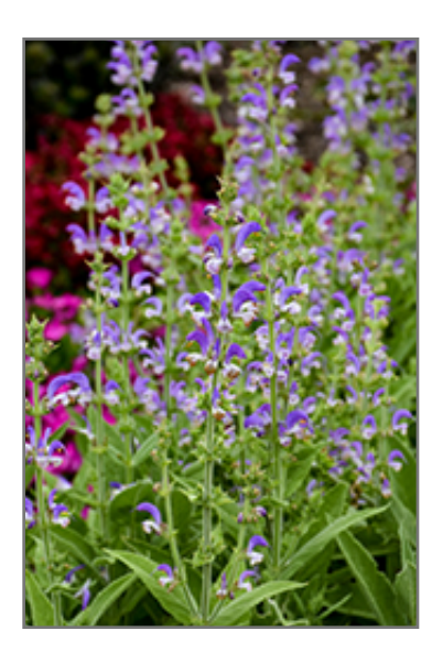
Olympus Gold Leaf Sage flowers