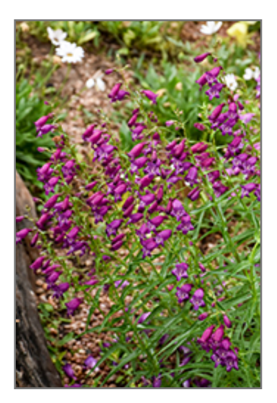
Windwalker Garnet Beard Tongue flowers

Long blooming and easy to care for, this variety produces stunning ruby red flowers with contrasting white throats; a great drought tolerant choice for garden beds, borders, rock gardens or containers