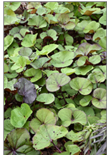
Othello Rayflower