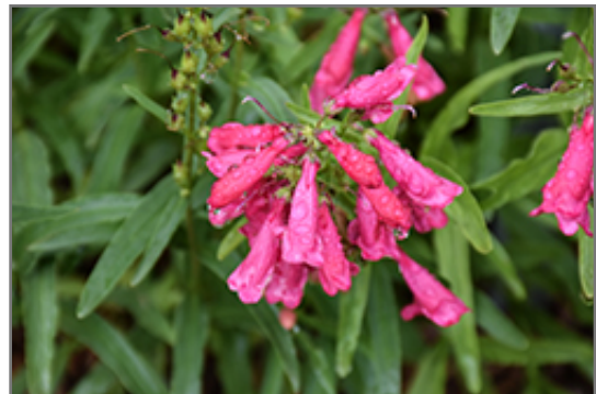
Coral Baby Beardtongue flowers