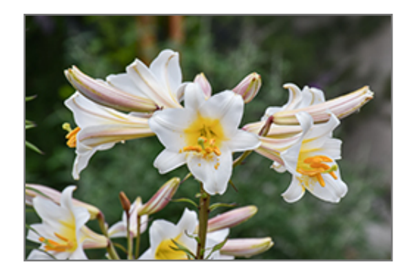
Regal Lily flowers

Regal Lily is an herbaceous perennial with a rigidly upright and towering form. Its medium texture blends into the garden, but can always be balanced by a couple of finer or coarser plants for an effective composition.