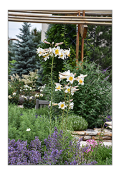
Regal Lily in bloom

This plant will require occasional maintenance and upkeep, and should be cut back in late fall in preparation for winter. Gardeners should be aware of the following characteristic(s) that may warrant special consideration;