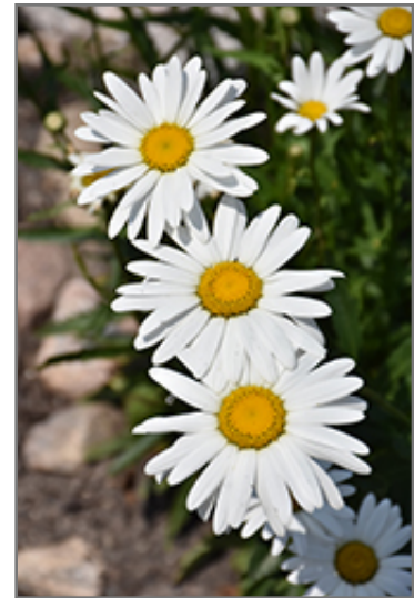
Silver Princess Shasta Daisy flowers