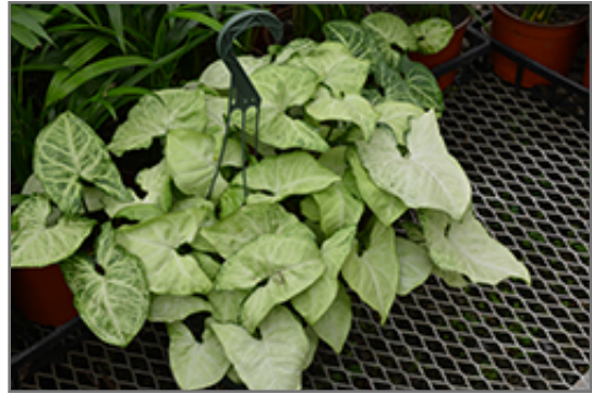
Bright Allusion Arrowhead Plant in full

This is an herbaceous evergreen houseplant with a spreading, ground-hugging habit of growth. This plant can be pruned at any time to keep it looking its best.