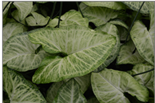
Bright Allusion Arrowhead Plant foliage