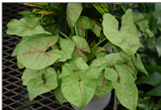
Berry Allusion Arrowhead Plant in full

When grown indoors, Berry Allusion Arrowhead Plant can be expected to grow to be about 12 inches tall at maturity, with a spread of 6 feet. It grows at a fast rate, and under ideal conditions can be expected to live for approximately 10 years. This houseplant performs well in both bright or indirect sunlight and strong artificial light, and can therefore be situated in almost any well-lit room or location. It prefers to grow in average to moist soil. The surface of the soil shouldn't be allowed to dry out completely, and so you should expect to water this plant once and possibly even twice each week. Be aware that your particular watering schedule may vary depending on its location in the room, the pot size, plant size and other conditions; if in doubt, ask one of our experts in the store for advice. It is not particular as to soil pH, but grows best in rich soil. Contact the store for specific recommendations on pre-mixed potting soil for this plant. Be warned that parts of this plant are known to be toxic to humans and animals, so special care should be exercised if growing it around children and pets.