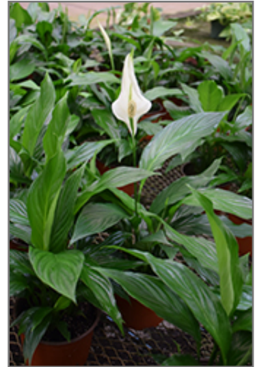
Figaro Peace Lily in full

This is a dense herbaceous houseplant with an upright spreading habit of growth. Its relatively coarse texture stands it apart from other indoor plants with finer foliage. This plant may benefit from an occasional pruning to look its best.