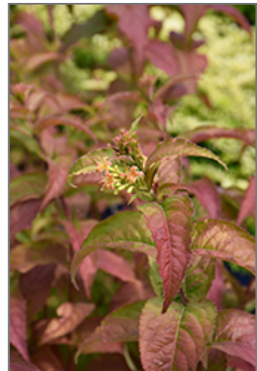
Firefly Diervilla flowers