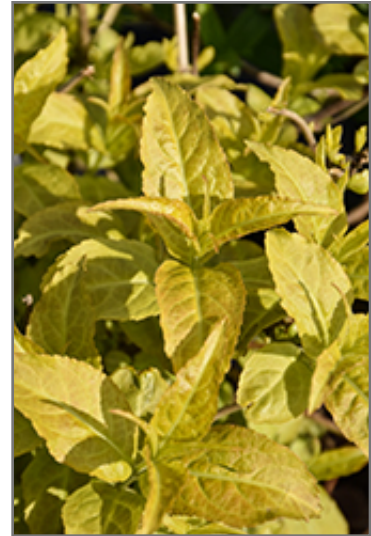
Firefly Diervilla foliage

Firefly Diervilla makes a fine choice for the outdoor landscape, but it is also well-suited for use in outdoor pots and containers. Because of its height, it is often used as a 'thriller' in the 'spiller-thriller-filler' container combination; plant it near the center of the pot, surrounded by smaller plants and those that spill over the edges. It is even sizeable enough that it can be grown alone in a suitable container. Note that when grown in a container, it may not perform exactly as indicated on the tag - this is to be expected. Also note that when growing plants in outdoor containers and baskets, they may require more frequent waterings than they would in the yard or garden. Be aware that in our climate, most plants cannot be expected to survive the winter if left in containers outdoors, and this plant is no exception. Contact our experts for more information on how to protect it over the winter months.