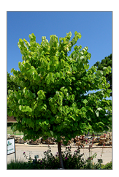
Rise 'N Shine Redbud