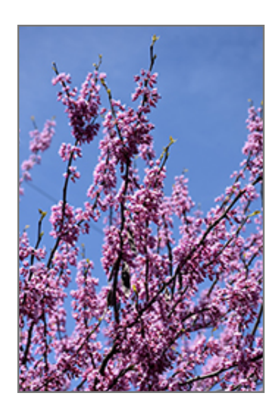
Rise 'N Shine Redbud flowers

Rise 'N Shine Redbud is recommended for the following landscape applications;