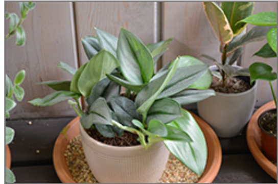
Moonlight Scindapsus in full

When grown indoors, Moonlight Scindapsus can be expected to grow to be about 10 feet tall at maturity, with a spread of 24 inches. It grows at a medium rate, and under ideal conditions can be expected to live for approximately 10 years. This houseplant performs well in both bright or indirect sunlight and strong artificial light, and can therefore be situated in almost any well-lit room or location. It does best in average to evenly moist soil, but will not tolerate standing water. The surface of the soil shouldn't be allowed to dry out completely, and so you should expect to water this plant once and possibly even twice each week. Be aware that your particular watering schedule may vary depending on its location in the room, the pot size, plant size and other conditions; if in doubt, ask one of our experts in the store for advice. It will benefit from a regular feeding with a general-purpose fertilizer with every second or third watering. It is not particular as to soil type or pH; an average potting soil should work just fine. Be warned that parts of this plant are known to be toxic to humans and animals, so special care should be exercised if growing it around children and pets.