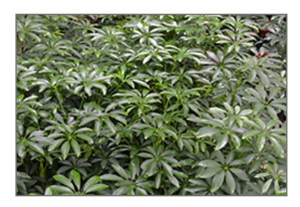
Mini Dwarf Umbrella Tree foliage

When grown indoors, Mini Dwarf Umbrella Tree can be expected to grow to be about 10 inches tall at maturity, with a spread of 8 inches. It grows at a medium rate, and under ideal conditions can be expected to live for approximately 10 years. This houseplant performs well in both bright or indirect sunlight and strong artificial light, and can therefore be situated in almost any well-lit room or location. It does best in average to evenly moist soil, but will not tolerate standing water. The surface of the soil shouldn't be allowed to dry out completely, and so you should expect to water this plant once and possibly even twice each week. Be aware that your particular watering schedule may vary depending on its location in the room, the pot size, plant size and other conditions; if in doubt, ask one of our experts in the store for advice. It will benefit from a regular feeding with a general-purpose fertilizer with every second or third watering. It is not particular as to soil type or pH; an average potting soil should work just fine. Be warned that parts of this plant are known to be toxic to humans and animals, so special care should be exercised if growing it around children and pets.