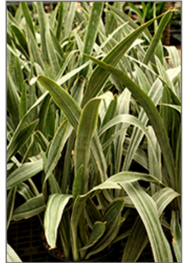
Sayuri Snake Plant foliage

When grown indoors, Sayuri Snake Plant can be expected to grow to be about 3 feet tall at maturity, with a spread of 18 inches. It grows at a slow rate, and under ideal conditions can be expected to live for approximately 10 years. This houseplant performs well in both bright or indirect sunlight and strong artificial light, and can therefore be situated in almost any well-lit room or location. It is very adaptable to both dry and moist soil, and should do just fine under average home conditions. The surface of the soil shouldn't be allowed to dry out completely, and so you should expect to water this plant once and possibly even twice each week. Be aware that your particular watering schedule may vary depending on its location in the room, the pot size, plant size and other conditions; if in doubt, ask one of our experts in the store for advice. It will benefit from a regular feeding with a general-purpose fertilizer with every second or third watering. It is not particular as to soil pH, but grows best in sandy soil. Contact the store for specific recommendations on pre-mixed potting soil for this plant.