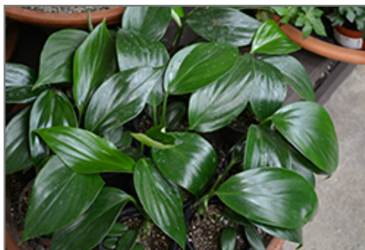
Dragon Tail Plant in full

When grown indoors, Dragon Tail Plant can be expected to grow to be about 10 feet tall at maturity, with a spread of 4 feet. It grows at a medium rate, and under ideal conditions can be expected to live for approximately 20 years. This houseplant performs well in both bright or indirect sunlight and strong artificial light, and can therefore be situated in almost any well-lit room or location. It does best in average to evenly moist soil, but will not tolerate standing water. The surface of the soil shouldn't be allowed to dry out completely, and so you should expect to water this plant once and possibly even twice each week. Be aware that your particular watering schedule may vary depending on its location in the room, the pot size, plant size and other conditions; if in doubt, ask one of our experts in the store for advice. It will benefit from a regular feeding with a general-purpose fertilizer with every second or third watering. It is not particular as to soil type or pH; an average potting soil should work just fine. Be warned that parts of this plant are known to be toxic to humans and animals, so special care should be exercised if growing it around children and pets.