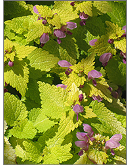
Golden Spotted Dead Nettle flowers

Golden Spotted Dead Nettle has masses of beautiful spikes of violet flowers rising above the foliage from mid spring to early fall, which are most effective when planted in groupings. Its attractive oval leaves emerge yellow in spring, turning lemon yellow in colour with prominent silver stripes throughout the season.