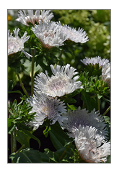
Divinity Aster flowers