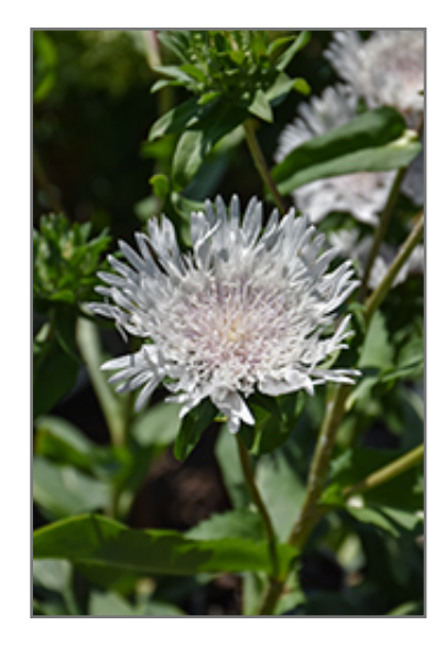
Divinity Aster flowers

Divinity Aster is recommended for the following landscape applications;