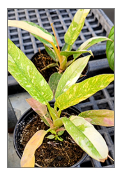
Ring of Fire Philodendron foliage

When grown indoors, Ring of Fire Philodendron can be expected to grow to be about 4 feet tall at maturity, with a spread of 4 feet. It grows at a medium rate, and under ideal conditions can be expected to live for approximately 10 years. This houseplant performs well in both bright or indirect sunlight and strong artificial light, and can therefore be situated in almost any well-lit room or location. It does best in average to evenly moist soil, but will not tolerate standing water. The surface of the soil shouldn't be allowed to dry out completely, and so you should expect to water this plant once and possibly even twice each week. Be aware that your particular watering schedule may vary depending on its location in the room, the pot size, plant size and other conditions; if in doubt, ask one of our experts in the store for advice. It will benefit from a regular feeding with a general-purpose fertilizer with every second or third watering. It is not particular as to soil type or pH; an average potting soil should work just fine. Be warned that parts of this plant are known to be toxic to humans and animals, so special care should be exercised if growing it around children and pets.