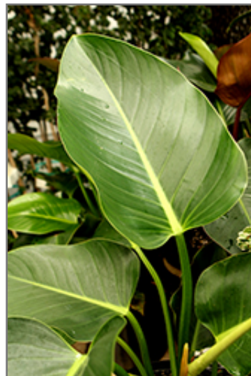
Green Congo Philodendron foliage

When grown indoors, Green Congo Philodendron can be expected to grow to be about 4 feet tall at maturity, with a spread of 3 feet. It grows at a fast rate, and under ideal conditions can be expected to live for approximately 10 years. This houseplant performs well in both bright or indirect sunlight and strong artificial light, and can therefore be situated in almost any well-lit room or location. It prefers to grow in average to moist soil. The surface of the soil shouldn't be allowed to dry out completely, and so you should expect to water this plant once and possibly even twice each week. Be aware that your particular watering schedule may vary depending on its location in the room, the pot size, plant size and other conditions; if in doubt, ask one of our experts in the store for advice. It will benefit from a regular feeding with a general-purpose fertilizer with every second or third watering. It is not particular as to soil type or pH; an average potting soil should work just fine. Be warned that parts of this plant are known to be toxic to humans and animals, so special care should be exercised if growing it around children and pets.