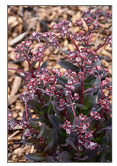
Conga Line Stonecrop flowers

Conga Line Stonecrop is a fine choice for the garden, but it is also a good selection for planting in outdoor pots and containers. With its upright habit of growth, it is best suited for use as a 'thriller' in the 'spiller-thriller-filler' container combination; plant it near the center of the pot, surrounded by smaller plants and those that spill over the edges. Note that when growing plants in outdoor containers and baskets, they may require more frequent waterings than they would in the yard or garden. Be aware that in our climate, most plants cannot be expected to survive the winter if left in containers outdoors, and this plant is no exception. Contact our experts for more information on how to protect it over the winter months.