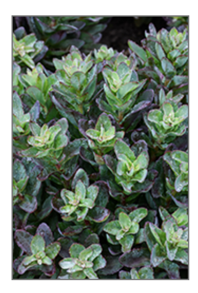
Conga Line Stonecrop foliage

This is a relatively low maintenance plant, and is best cleaned up in early spring before it resumes active growth for the season. It is a good choice for attracting bees and butterflies to your yard, but is not particularly attractive to deer who tend to leave it alone in favor of tastier treats. It has no significant negative characteristics.