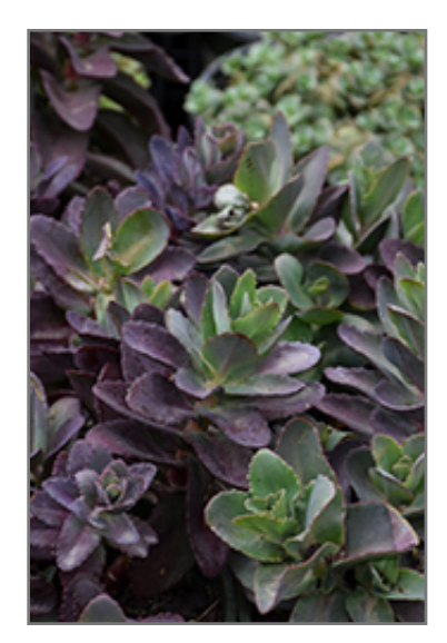
Conga Line Stonecrop foliage