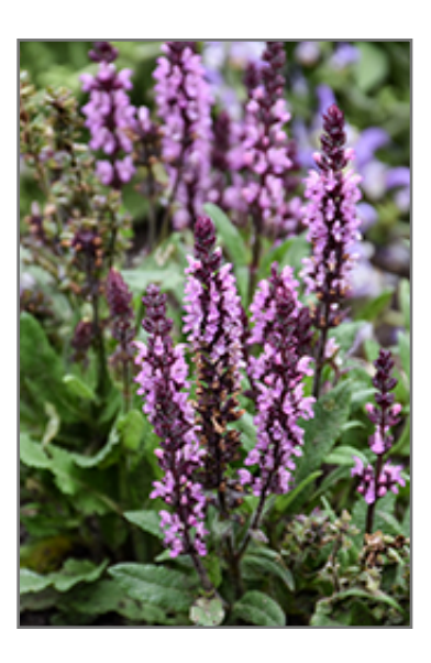
Spring King Mini Rose Meadow Sage flowers

A miniature, early blooming variety producing stunning spikes of rich rose-pink flowers; deadhead faded blooms for extended garden color; extra compact and tidy; excellent for sunny border fronts or containers