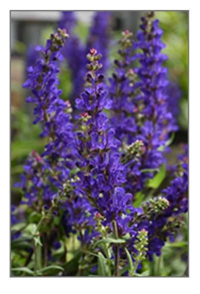
Dark Matter Meadow Sage flowers

Dark Matter Meadow Sage is an herbaceous perennial with an upright spreading habit of growth. Its relatively fine texture sets it apart from other garden plants with less refined foliage.