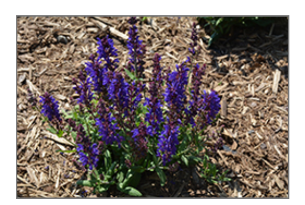
Dark Matter Meadow Sage in bloom

This is a relatively low maintenance plant, and is best cleaned up in early spring before it resumes active growth for the season. It is a good choice for attracting bees, butterflies and hummingbirds to your yard, but is not particularly attractive to deer who tend to leave it alone in favor of tastier treats. It has no significant negative characteristics.