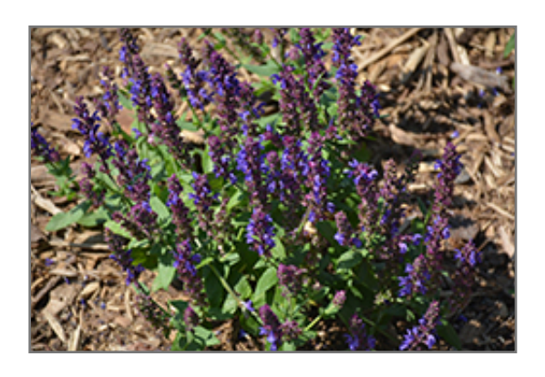
Apex Blue Meadow Sage in bloom

Apex Blue Meadow Sage is an herbaceous perennial with an upright spreading habit of growth. Its relatively fine texture sets it apart from other garden plants with less refined foliage.