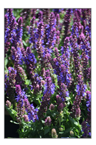
Apex Blue Meadow Sage flowers