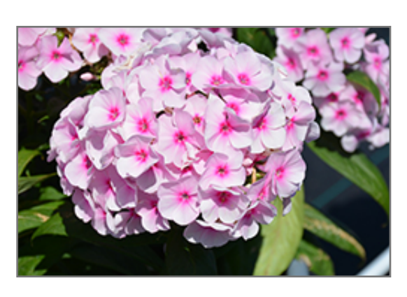
Flame Pro Soft Pink Garden Phlox flowers

An early flowering variety, producing fragrant, soft pink flowers with hot pink eyes, on compact plants suitable for the front of borders; provides a long season of color; thick, glossy green foliage has excellent mildew resistance