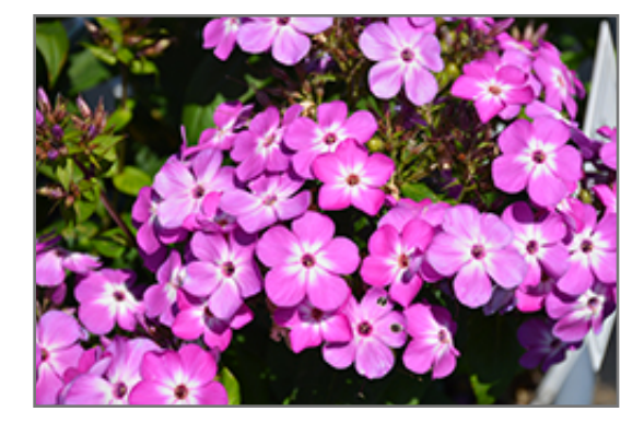
Flame Pro Purple Garden Phlox flowers