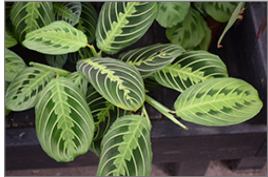
Lemon Lime Prayer Plant foliage

When grown indoors, Lemon Lime Prayer Plant can be expected to grow to be about 12 inches tall at maturity, with a spread of 12 inches. It grows at a slow rate, and under ideal conditions can be expected to live for approximately 5 years. This houseplant performs well in both bright or indirect sunlight and strong artificial light, and can therefore be situated in almost any well-lit room or location. It prefers to grow in average to moist soil. The surface of the soil shouldn't be allowed to dry out completely, and so you should expect to water this plant once and possibly even twice each week. Be aware that your particular watering schedule may vary depending on its location in the room, the pot size, plant size and other conditions; if in doubt, ask one of our experts in the store for advice. It will benefit from a regular feeding with a general-purpose fertilizer with every second or third watering. It is not particular as to soil type or pH; an average potting soil should work just fine.