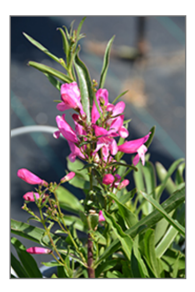
Pristine Princess Pink Beardtongue flowers

A beautiful summer bloomer with an upright clumping habit, ideal for beds, borders and containers; large sturdy stems with rich pink, tubular flowers rise above glossy green foliage; long blooming; excellent for cut flowers; drought tolerant