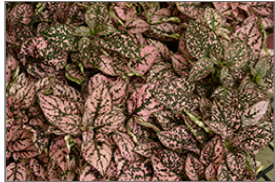
Polka Dot Plant foliage

When grown indoors, Polka Dot Plant can be expected to grow to be about 12 inches tall at maturity, with a spread of 12 inches. It grows at a fast rate, and under ideal conditions can be expected to live for approximately 5 years. This houseplant will do well in a location that gets either direct or indirect sunlight, although it will usually require a more brightly-lit environment than what artificial indoor lighting alone can provide. It does best in average to evenly moist soil, but will not tolerate standing water. The surface of the soil shouldn't be allowed to dry out completely, and so you should expect to water this plant once and possibly even twice each week. Be aware that your particular watering schedule may vary depending on its location in the room, the pot size, plant size and other conditions; if in doubt, ask one of our experts in the store for advice. It should not require much in the way of fertilizing once established, although it may appreciate a shot of general-purpose fertilizer from time to time. It is not particular as to soil type or pH; an average potting soil should work just fine.