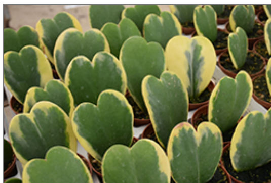
Variegated Sweetheart Plant in full

When grown indoors, Variegated Sweetheart Plant can be expected to grow to be about 10 feet tall at maturity, with a spread of 24 inches. It grows at a medium rate, and under ideal conditions can be expected to live for approximately 10 years. This houseplant will do well in a location that gets either direct or indirect sunlight, although it will usually require a more brightly-lit environment than what artificial indoor lighting alone can provide. It is very adaptable to both dry and moist soil, but will not tolerate any standing water. The surface of the soil shouldn't be allowed to dry out completely, and so you should expect to water this plant once and possibly even twice each week. Be aware that your particular watering schedule may vary depending on its location in the room, the pot size, plant size and other conditions; if in doubt, ask one of our experts in the store for advice. It will benefit from a regular feeding with a general-purpose fertilizer with every second or third watering. It is not particular as to soil pH, but grows best in rich soil. Contact the store for specific recommendations on pre-mixed potting soil for this plant.