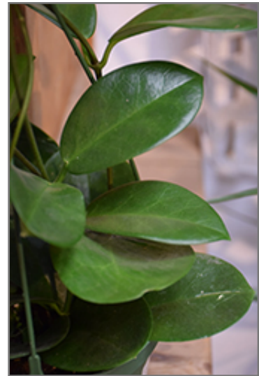
Waxvine foliage

This is an herbaceous houseplant with a spreading, ground-hugging habit of growth. This plant usually looks its best without pruning, although it will tolerate pruning.