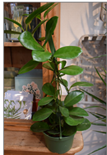
Waxvine in full