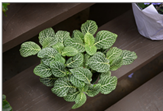
White Nerve Plant in full

When grown indoors, White Nerve Plant can be expected to grow to be about 10 inches tall at maturity, with a spread of 15 inches. It grows at a slow rate, and under ideal conditions can be expected to live for approximately 10 years. This houseplant performs well in both bright or indirect sunlight and strong artificial light, and can therefore be situated in almost any well-lit room or location. It prefers to grow in average to moist soil. The surface of the soil shouldn't be allowed to dry out completely, and so you should expect to water this plant once and possibly even twice each week. Be aware that your particular watering schedule may vary depending on its location in the room, the pot size, plant size and other conditions; if in doubt, ask one of our experts in the store for advice. It will benefit from a regular feeding with a general-purpose fertilizer with every second or third watering. It is not particular as to soil type or pH; an average potting soil should work just fine.