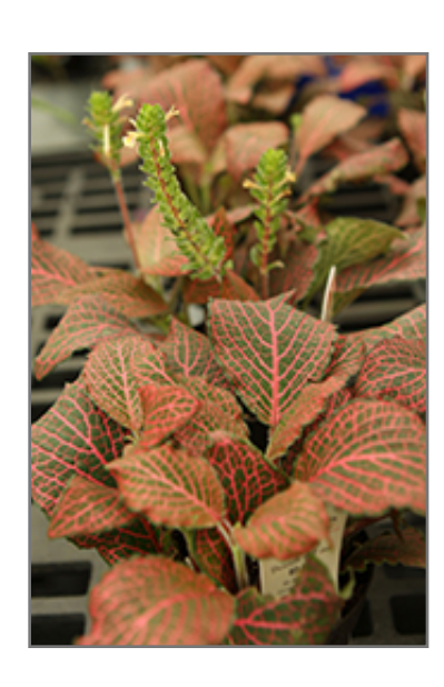
Nerve Plant foliage

When grown indoors, Nerve Plant can be expected to grow to be about 10 inches tall at maturity, with a spread of 15 inches. It grows at a slow rate, and under ideal conditions can be expected to live for approximately 10 years. This houseplant performs well in both bright or indirect sunlight and strong artificial light, and can therefore be situated in almost any well-lit room or location. It prefers to grow in average to moist soil. The surface of the soil shouldn't be allowed to dry out completely, and so you should expect to water this plant once and possibly even twice each week. Be aware that your particular watering schedule may vary depending on its location in the room, the pot size, plant size and other conditions; if in doubt, ask one of our experts in the store for advice. It will benefit from a regular feeding with a general-purpose fertilizer with every second or third watering. It is not particular as to soil type or pH; an average potting soil should work just fine.