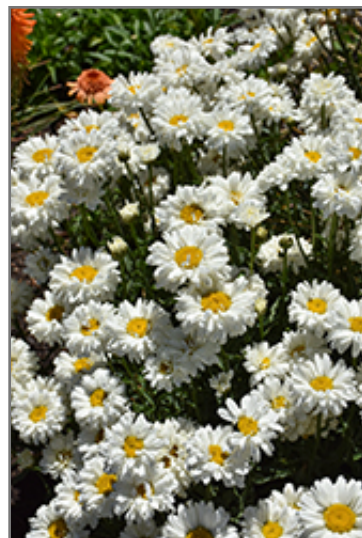
Sugar Bowl Shasta Daisy flowers