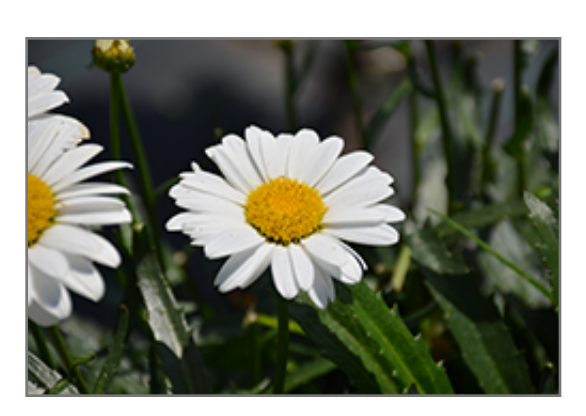
Lucille Chic Shasta Daisy flowers