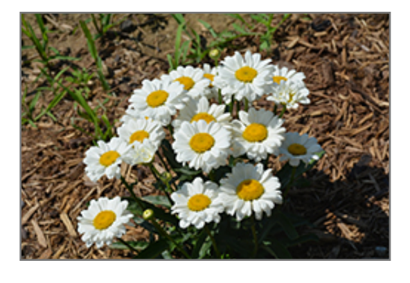
Sweet Daisy Jane Shasta Daisy in bloom

Sweet Daisy Jane Shasta Daisy is an herbaceous perennial with an upright spreading habit of growth. Its medium texture blends into the garden, but can always be balanced by a couple of finer or coarser plants for an effective composition.