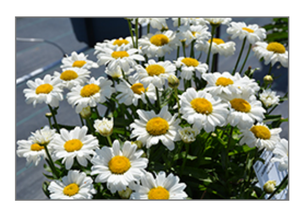
Sweet Daisy Jane Shasta Daisy flowers

This plant will require occasional maintenance and upkeep. Trim off the flower heads after they fade and die to encourage more blooms late into the season. It is a good choice for attracting butterflies to your yard. Gardeners should be aware of the following characteristic(s) that may warrant special consideration;