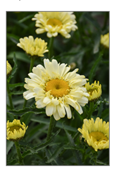
Sweet Daisy Izabel Shasta Daisy flowers

This plant will require occasional maintenance and upkeep, and should be cut back in late fall in preparation for winter. It is a good choice for attracting butterflies to your yard, but is not particularly attractive to deer who tend to leave it alone in favor of tastier treats. Gardeners should be aware of the following characteristic(s) that may warrant special consideration;