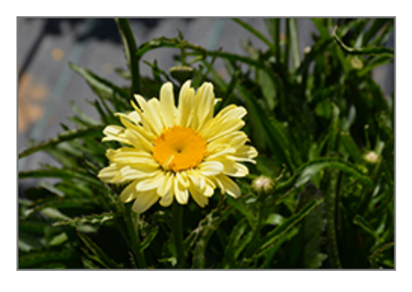
Sweet Daisy Izabel Shasta Daisy flowers

Sweet Daisy Izabel Shasta Daisy is an herbaceous perennial with an upright spreading habit of growth. Its medium texture blends into the garden, but can always be balanced by a couple of finer or coarser plants for an effective composition.