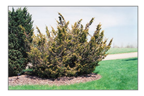
Gold Plume Juniper